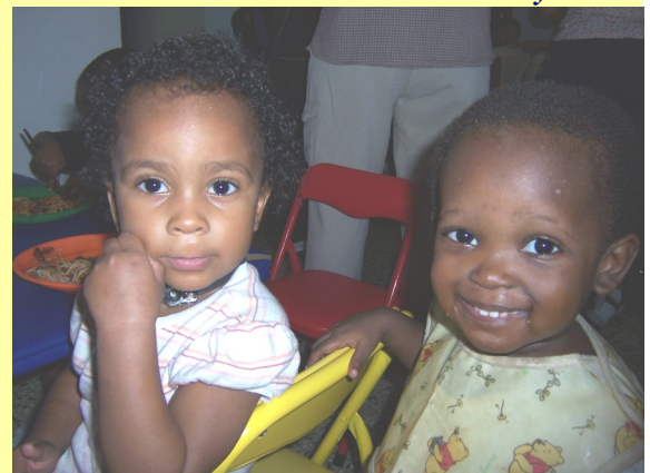
Dominican Republic orphans abandoned by their prostitute mothers.